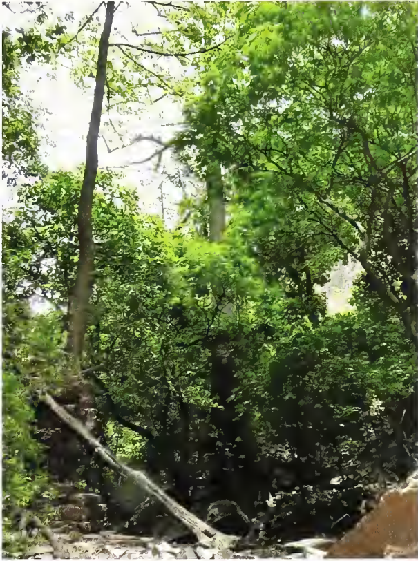
Figure 3. Interior view of a gallery forest, Dindéfello Nature Reserve, Senegal, April 2011 (N. Ruiz de Azua) Vue à l'intérieur d'une forêt galerie, Réserve Naturelle de Dindéfello, Sénégal, avril 2011 (N. Ruiz de Azua)